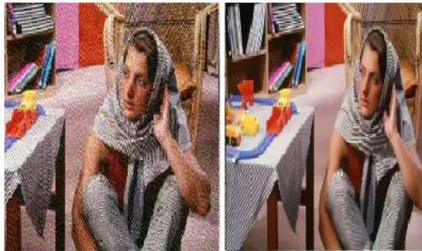
Fig 4(a) noisy image (b) result of non local means [15]

Fig 4(a) shows the noisy image that is affected by the gaussian noise. fig 4(b) shows the denoised version of previous noisy image. Image is denoised by using the concept of non local means.