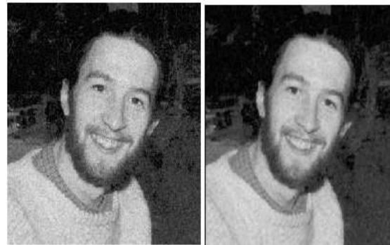
Fig 3(a) noisy image (b) result of median filtering [14]

Fig 3(a) shows the noisy image that is affected by the gaussian noise. fig 3(b) shows the denoised version of previous noisy image. Image is denoised by using the concept of median filtering.