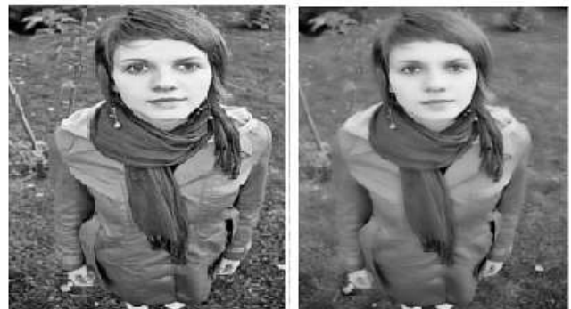
Fig2(a) original image (b) result of bilateral filtering [13]

Fig 2(a) shows the original image fig 2(b) shows the denoised version of noisy image by using the concept of bilateral filtering